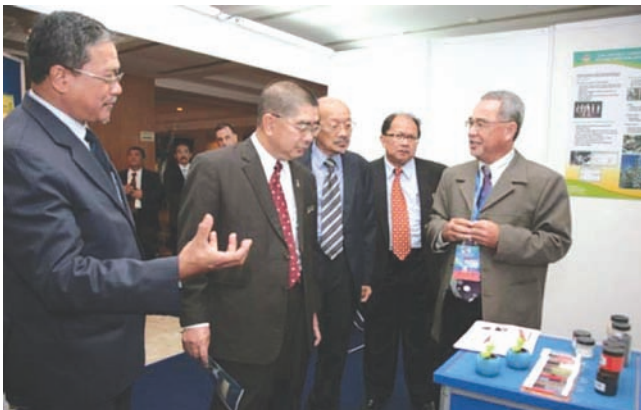
Honourable Minister of Science, Technology and Innovation (MOSTI) visiting one of the exhibition booths during ICEM 2010

MSNT is very proud to have been able to play its role in advancing science and technology in this country by organising a prestigious International Conference for Experimental Mechanics 2010 (ICEM 2010) in Kuala Lumpur from 29 November to 1 December 2010. The conference was organised jointly with the Malaysian Association of Research Scientists and attracted scientists and technologists from more than 28 countries.