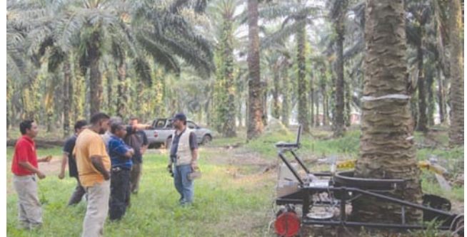
GammaScorpion being tested at Felda Serting, Negri Sembilan

On 19-22 October 2010, a joint field test between Felda Agricultural Sdn Bhd (FASSB) and Plant Assessment Technology (PAT), the Industrial Technology Division of Nuclear Malaysia, was conducted at Felda Serting Hilir Palm Oil Plantation, Negeri Sembilan.