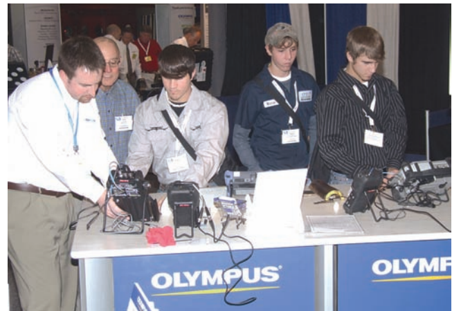
Hands-on demonstrations at the Olympus exhibition booth

Houston, Texas, USA, was the home of the 2010 ASNT Fall Conference and Quality Testing Show, held 15-19 November 2010. The ASNT annual event allows non-destructive testing (NDT) professionals from around the globe to take part in an energetic and informative week of activities. This year's conference had 1777 registered participants, representing a diverse group of the NDT methods and techniques. The exceptional professional programme featured 115 papers presented in 33 different sessions. The presented papers represented a variety of NDT techniques and applications and provided participants with some of the most up-to-date information in the NDT industry. The Quality Testing Show, with 153 exhibitors participating, also gave attendees some of the latest NDT information and technology. Short courses, lectures and committee meetings rounded out the week, offering participants a wide range of activities throughout the conference.