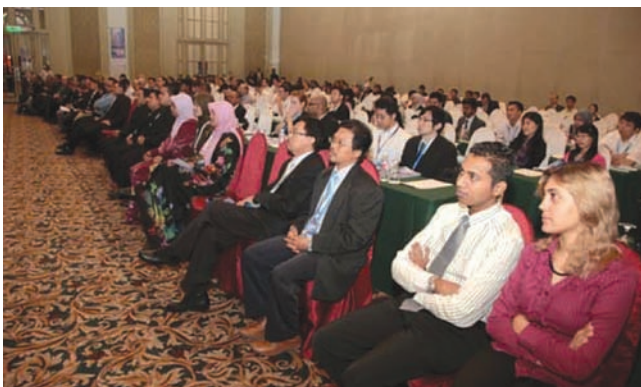
Participants attending ICEM 2010 in Kuala Lumpur