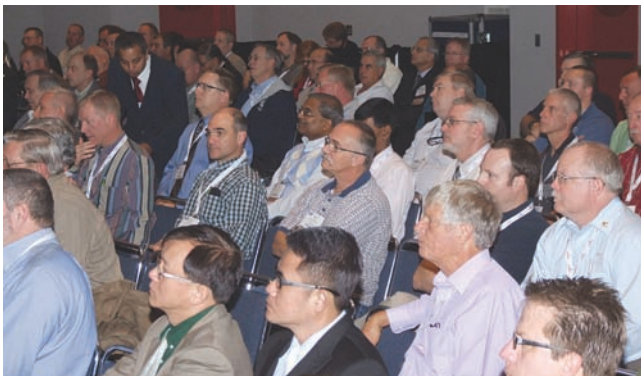
The high number of registered participants ensured all lecture rooms were packed out