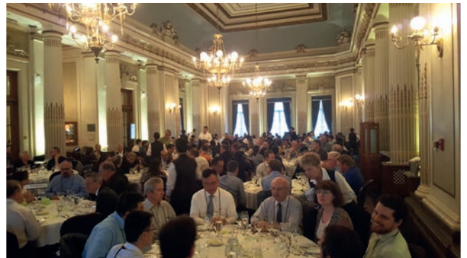
The beautiful main dining hall at Le Parlementaire

11th Regional Conference on Non-Destructive and Structural Testing