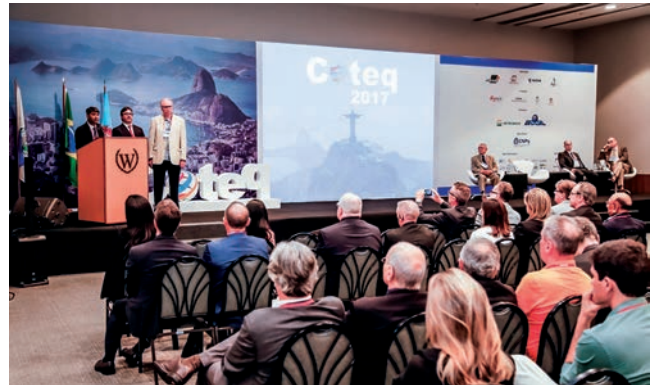
Almost 900 people attended COTEQ 2017

a special session on the aerospace sector during the Congresso Nacional de Ensaio Não Destrutivos e Inspeção – ConaEnd (National Congress of Non-Destructive Testing and Inspection), scheduled to take place during August 2018. As for ABENDI, it will hold the 2ª Edição do Fórum de Gerenciamento de Integridade de Linhas Flexíveis (2nd Forum on Flexible Risers Integrity Management (FRIM)), during the ASNT Annual Conference in October.