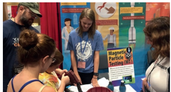
ASNT exhibiting at the 2017 National Science Teachers Association STEM Forum

ASNT also exhibited at the National Science Teachers Association (NSTA) STEM Forum for the first time. What better way to set the stage for science teachers to discover NDT than to meet them at their association's largest gathering?