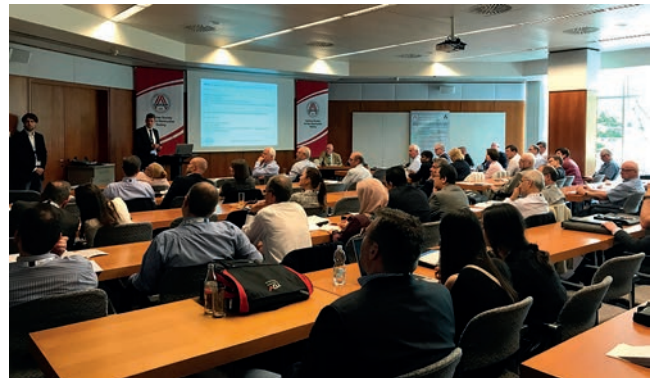
28 speakers from 15 nations presented at the 8th International Conference on Certification and Standardization in NDT

Sometimes the implementation of ISO 9712 is adapted to suit the local requirements. For example, in Russia the qualification examination may take place at the employer's premises and in Brazil there are examination centres that rotate around the country according to need. In both cases the requirements for confidentiality and security need to be met.