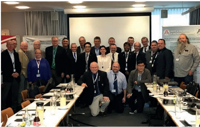
Members of the ICNDT Working Group for Qualification and Certification (WG1), who met in Vienna