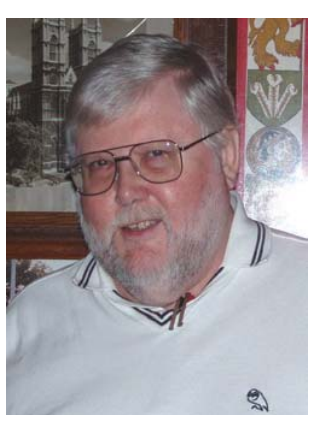
R K Stanley

arrays. Attendees will see the Quality Testing Show with its over 100 exhibitors demonstrating the latest in NDT equipment and services. The Quality Testing Show is said to be the world's largest annual tradeshow dedicated to non-destructive testing. Attendees can tour the Yucca Mountain Repository which is the United State's first long-term geologic repository for spent nuclear fuel and high-