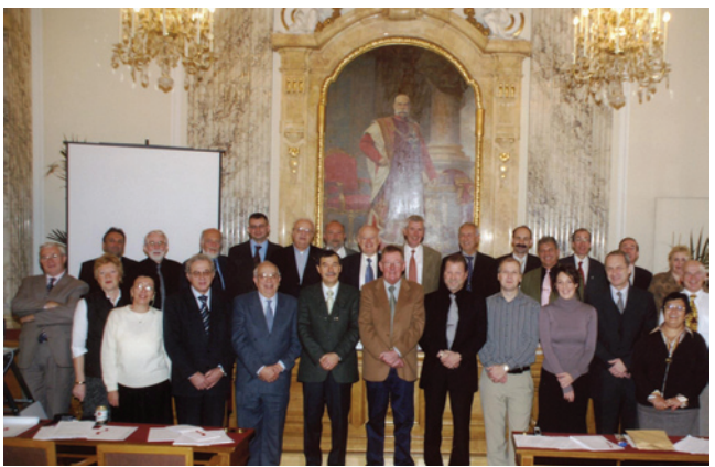
Those present at the General Assembly in the main hall of the Vienna Chamber of Commerce. In all, 21 member societies were represented

The next Board Meeting will be in Glasgow on 27 January 2006 and the following one in Budapest on 22 May 2006. The next General Assembly will be in Berlin on Friday 29 September