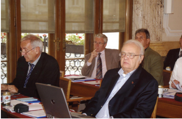
Members of the Board at the General Assembly meeting in Vienna

The Russian Society was selected to host the 10th ECNDT in 2010 in Moscow.