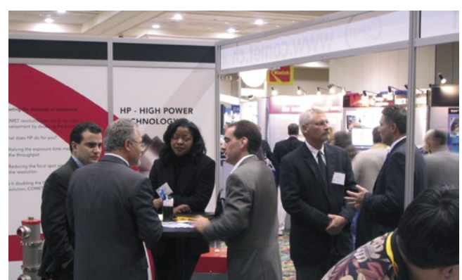
Exhibitors and attendees at the Quality Testing Show opening

Attendance at the Quality Testing Show was consistently high