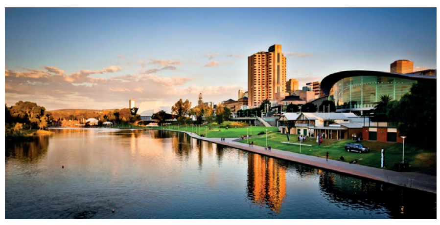
The conference will be held in the beautiful surroundings of Adelaide in South Australia