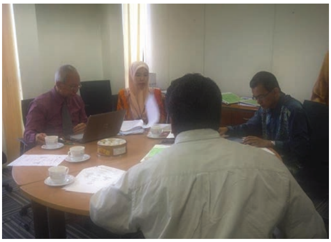
View of the final auditing process, where the Chief Auditor goes through all documents

The Malaysian Society for NDT (MSNT) wishes to congratulate the Department of Skill Manpower Development (JPK), Ministry of Human Resource, as the NDT National Certification Body for being accredited to ISO 17024 by the National Accreditation Body on 3 October 2012.