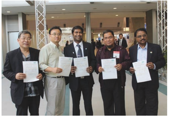
Representatives from the NDT societies of China, Korea, Singapore, Malaysia and India displaying the ICNDT documents they signed in the Exhibition Hall

MSNT wishes to thank ISNDI for the efforts made towards strengthening NDT activities in Asia.