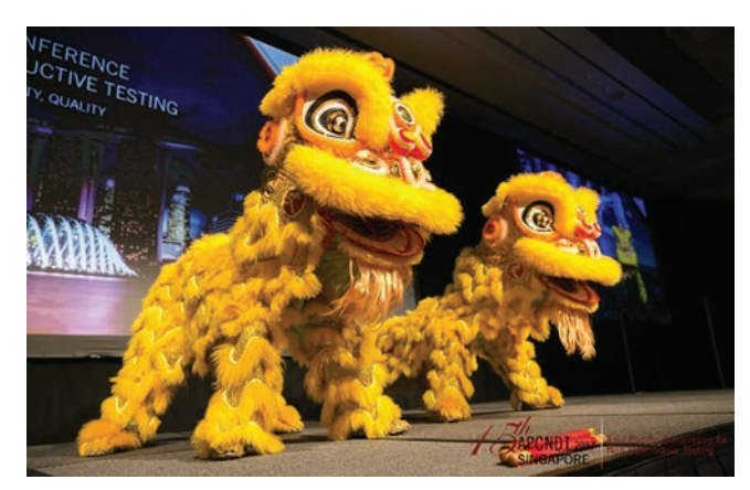
The conference was opened with a traditional lion dance

and Members thank all the delegates, participants, exhibitors, sponsors and supporting NDT societies for their strong support and contributions.