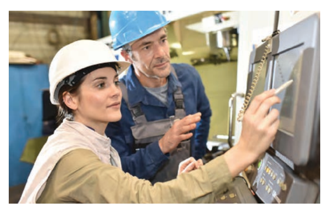
The university offers a range of comprehensive non-destructive testing and evaluation training, from bac +2 to bac +8

The university offers a range of comprehensive non-destructive testing and evaluation training, from bac +2 to bac +8, with a speciality in acoustics and physics, and is open to employees, students, job seekers and people in professional retraining.