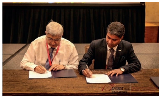
NDTSS signed two bilateral MOU with ISNT and MSNT

NDTSS presented its first ISO 9712 certification during the conference; the certification was achieved as a result of the Integrated Work Study Programme (IWSP) developed by the Singapore Institute of Technology (SIT) and NDTSS. The programme is the first of its kind in the region and is expected to attract young graduates to the industry.