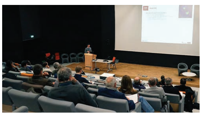
The doctorands, generally in their second or third year of thesis, had 25 minutes to present their work

As in the previous edition, the industrialists' poster session triggered discussions from the very first day and put forward the expectations of participants in the field. The next day, the exchanges continued in workshops centred on the career development and