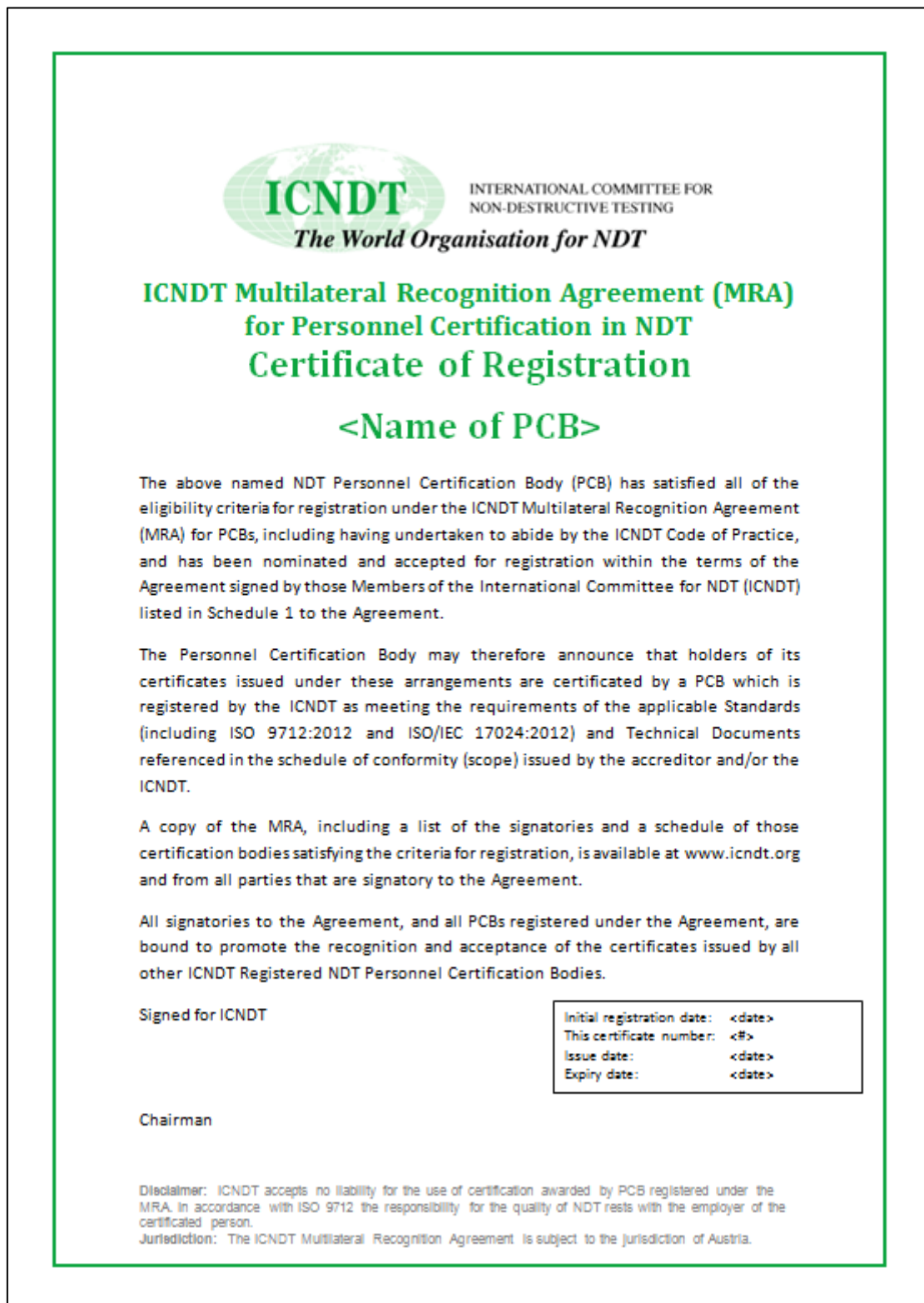
Figure 1: Example of a certificate