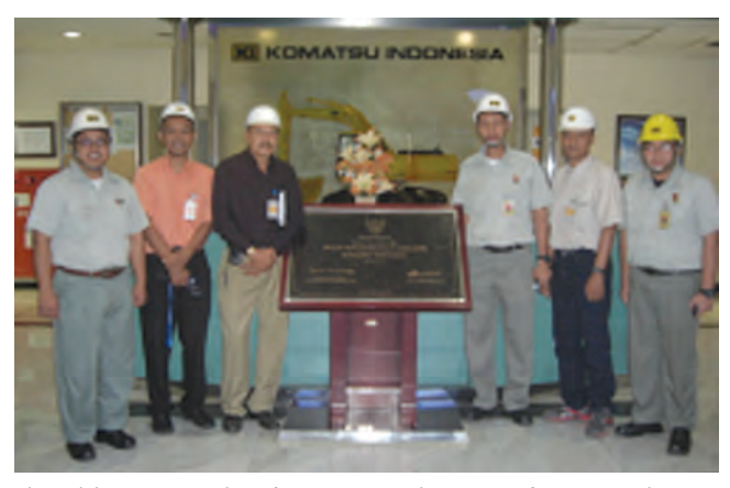
Site visit and meeting for the establishment of co-operation on human resource development, manufacturing group establishment, R&D and NDT calibration block specimen production between the Indonesian Society for NDT (AUTRI) and PT Komatsu Indonesia, which manufactures construction and mining equipment