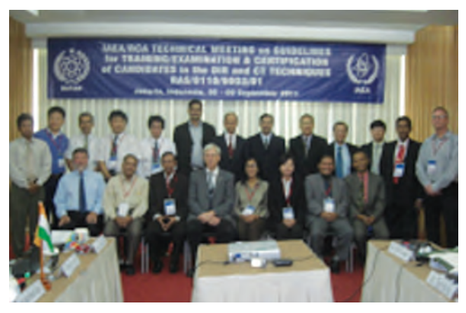
IAEA/RCA technical meeting on guidelines for training/examinations and certification of candidates in the DIR and CT techniques (RAS/8110) organised by IAEA in co-operation with the National Nuclear Energy Agency (BATAN), Jakarta, 5-9 September 2011