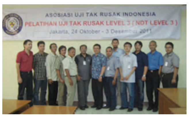
Participants of the National Training Course on NDT Level 3 organised by the Indonesian Society for NDT (AUTRI) in co-operation with the National Nuclear Energy Agency, the Center for Material and Technical Products (B4T), B2TKS-BPPT and related NDT companies, Jakarta, 24 October-3 December 2011