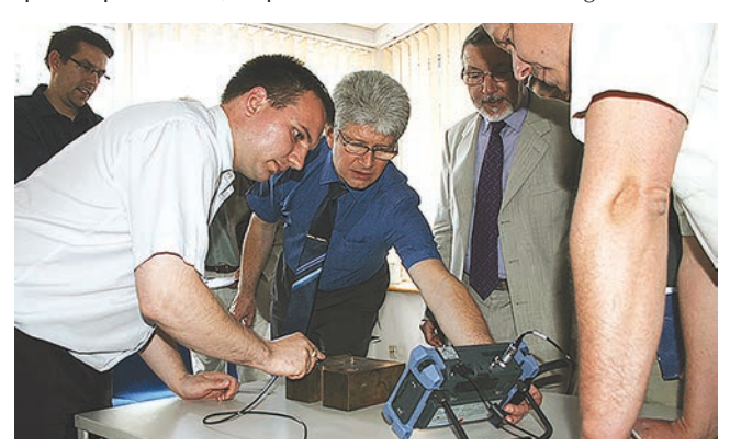
The NDT Laboratory and Knowledge Centre opened in June 2015

B ay Zoltán Applied Research Coordination Agency, Hungary, is supporting Hungarian research and development in the field of non-destructive testing and evaluation by providing qualified and skilled experts as well as infrastructure. Its activities include the introduction of new methods, the development of specific procedures, inspection validation and training.