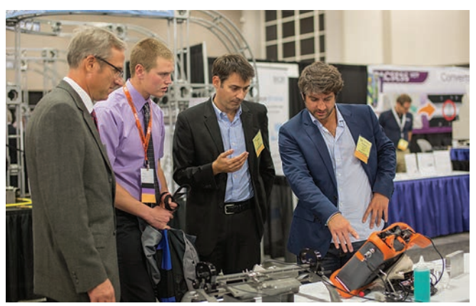
Over 200 companies exhibited during the 2015 ASNT Annual Conference

Attendees were also invited to participate in committee meetings, information sessions and networking activities, while the exhibition hall provided ample opportunity to view the products and services of more than 200 companies.