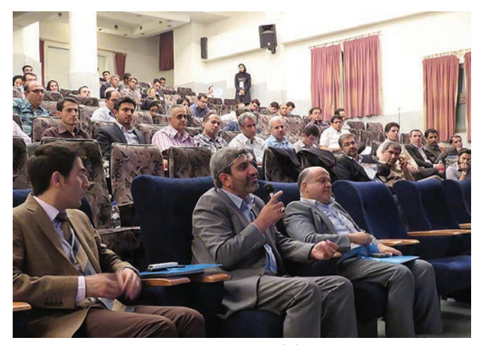
More than 200 people attended the joint event, hosted by the University of Tehran

n 15 June 2015, the Iranian Society for Nondestructive Testing (IRNDT) and the Iranian Society of Technical Inspection & NDT Companies (IRSNT) held a joint event incorporating the 6th IRNDT Members Gathering and the NDT Night Celebration. This event celebrated IRNDT's full membership status within the International Committee for Non-Destructive Testing (ICNDT) as the official representation for the Iranian NDT community. More than 200 people were in attendance for this important event, which was held in the auditorium of the Faculty of Metallurgy and Materials Engineering at the University of Tehran.