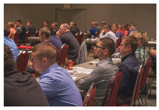
Many activities aimed at students took place alongside the conference

Student events began on the Sunday prior to the beginning of the conference, starting with the Student Career Workshop. Topics included résumé preparation, interview instruction and networking, so that incoming NDT employees could make themselves stand-out candidates in the field. Students could then practice their newly-learned skills in an interview programme with representatives from NDT companies.