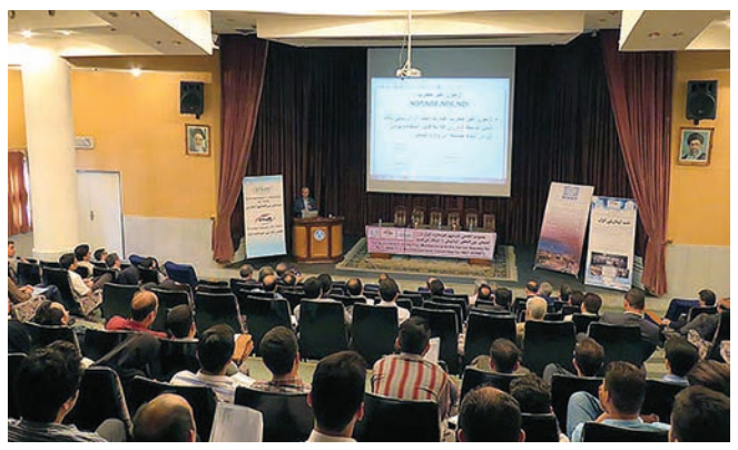
Proceedings commenced with three welcome speeches

Participants were then invited to a panel discussion, which provided a venue to ask questions about the activities of the two societies and make suggestions for future tasks that the two societies