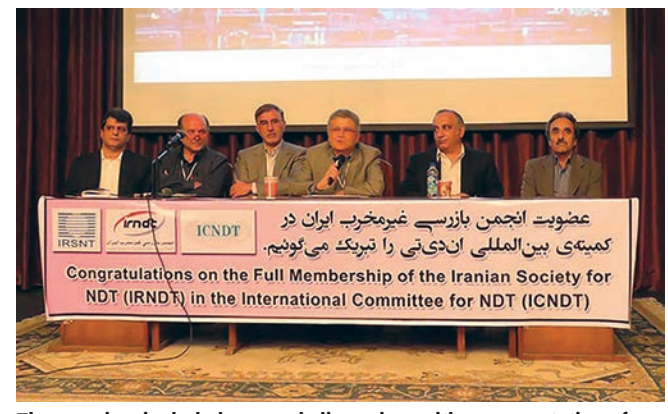
The evening included a panel discussion with representatives from both IRNDT and IRSNT

should consider. Some of the topics discussed in the panel session included: the development of new NDT technologies and services; closer cooperation of the societies with government organisations; current concerns of the NDT community; the upcoming Iranian NDT Conference; and the publications, membership and cooperation of the two societies.