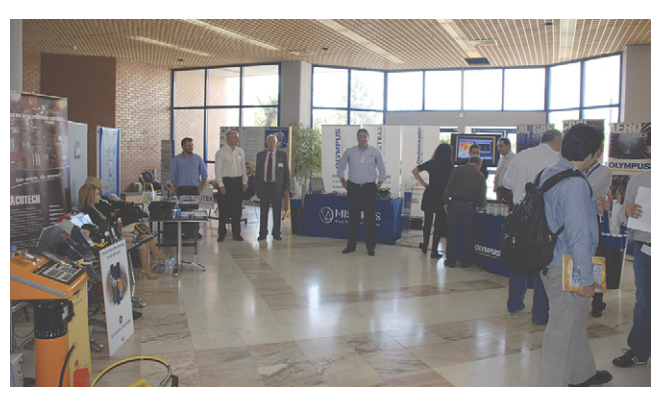
The mini-exhibition was very impressive

The number of participants at the conference and the visitors to the exhibition combined, coming from industry as well as from the university community, amounted to more than 500 in total.