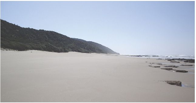
Some people think of Africa as a place of spectacular wildlife and unspoilt nature, of pristine beaches and lofty mountains