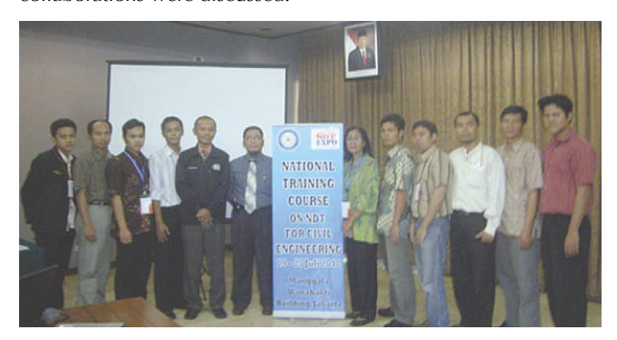
Some of the participants attending the National Training Course on NDT for Concrete Inspection

As a symbol of friendship, MSNT sent its delegation to this expo. The delegation comprised four MSNT members, led by the President who also presented a paper entitled: 'Expanding NDT Application for Concrete Inspection' in the seminar organised in conjunction with this EXPO. In addition, the MSNT President was also invited as one of the panelists in a special forum held during the EXPO, discussing various issues related to NDT. It is great to observe that, during this event, members of the MSNT delegation established links with various parties related to NDT and future collaborations were discussed.