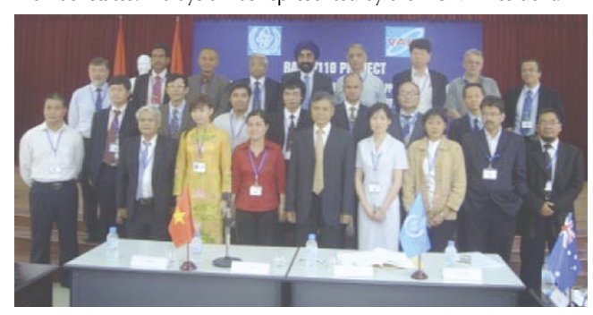
Participants of the meeting took a group photograph at the end of this meeting

In a bid to strengthen NDT technology to support our local industries, Malaysia has participated in an IAEA/RCA project on Advanced NDT. The project began in 2010 and is expected to end in 2012. The main focus of this project is to promote the application of the digital radiography method in member states. In addition, this project also addresses the need for accreditation of the NDT Certification Body (in accordance with ISO 17024) as well as NDT laboratories (in accordance with ISO 17020). The mid-term review meeting was held in Hanoi, Vietnam and attended by 20 individuals representing 14 member states. Malaysia was represented by the MSNT President.