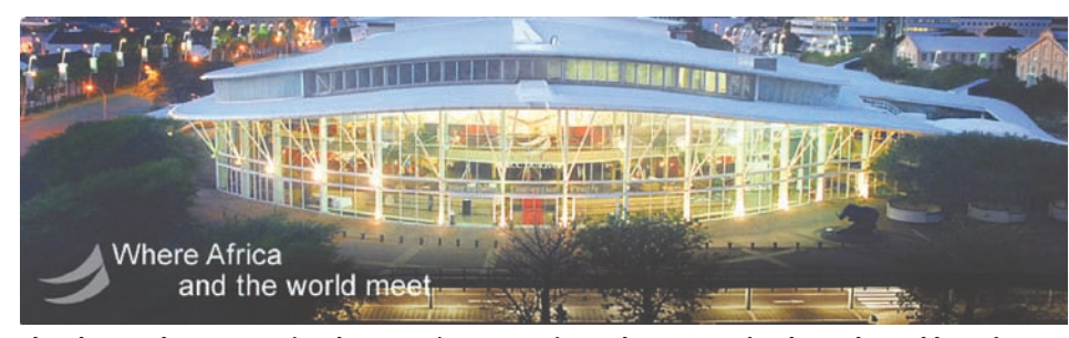
The ultra-modern International Convention Centre in Durban, venue for the 18th World Conference on Non-Destructive Testing

Management: The Conference Company. Tel: +27 31 303 9852; email: deidre@confco.co.za