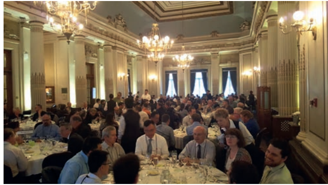
The beautiful main dining hall at Le Parlementaire

11th Regional Conference on Non-Destructive and Structural Testing