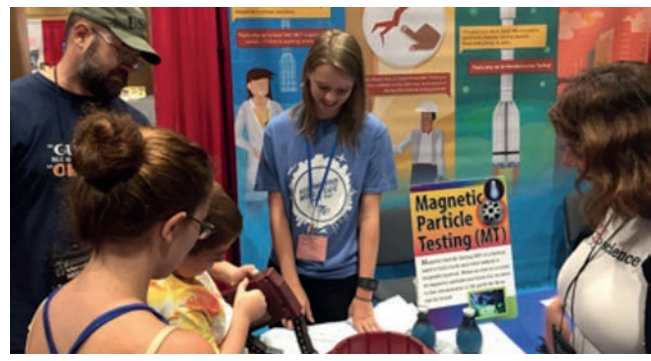
ASNT exhibiting at the 2017 National Science Teachers Association STEM Forum

ASNT also exhibited at the National Science Teachers Association (NSTA) STEM Forum for the first time. What better way to set the stage for science teachers to discover NDT than to meet them at their association's largest gathering?