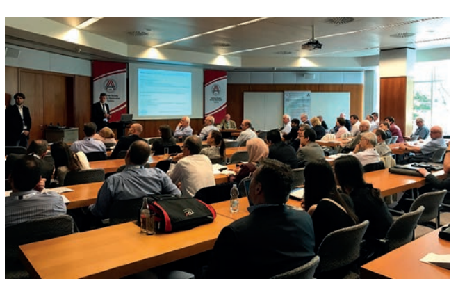
28 speakers from 15 nations presented at the 8th International Conference on Certification and Standardization in NDT

Sometimes the implementation of ISO 9712 is adapted to suit the local requirements. For example, in Russia the qualification examination may take place at the employer's premises and in Brazil there are examination centres that rotate around the country according to need. In both cases the requirements for confidentiality and security need to be met.