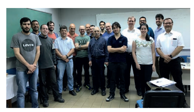
Participants of the digital radiography Level 2 course

Digital radiography Level 2 training and certification: the course was given in English by two German experts and recognised by the Argentinian certification authority, Instituto Argentino de Normalización y Certificación (IRAM). Personnel from Argentina, Brazil, Costa Rica and Mexico have been trained and certificated (November 2018).