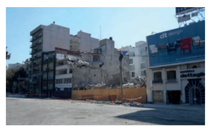
Consequences of an earthquake

An AAENDE-CEND (Committee on Civil Structures created within the Asociación Argentina Ensayos No Destructivos y Estructurales (AAENDE)) expert collaborated in the first coordination meeting of the project, which was held in Mexico. He presented lectures and participated in a special team, which supported the Mexican authorities in the NDT inspections after an earthquake (November 2017).